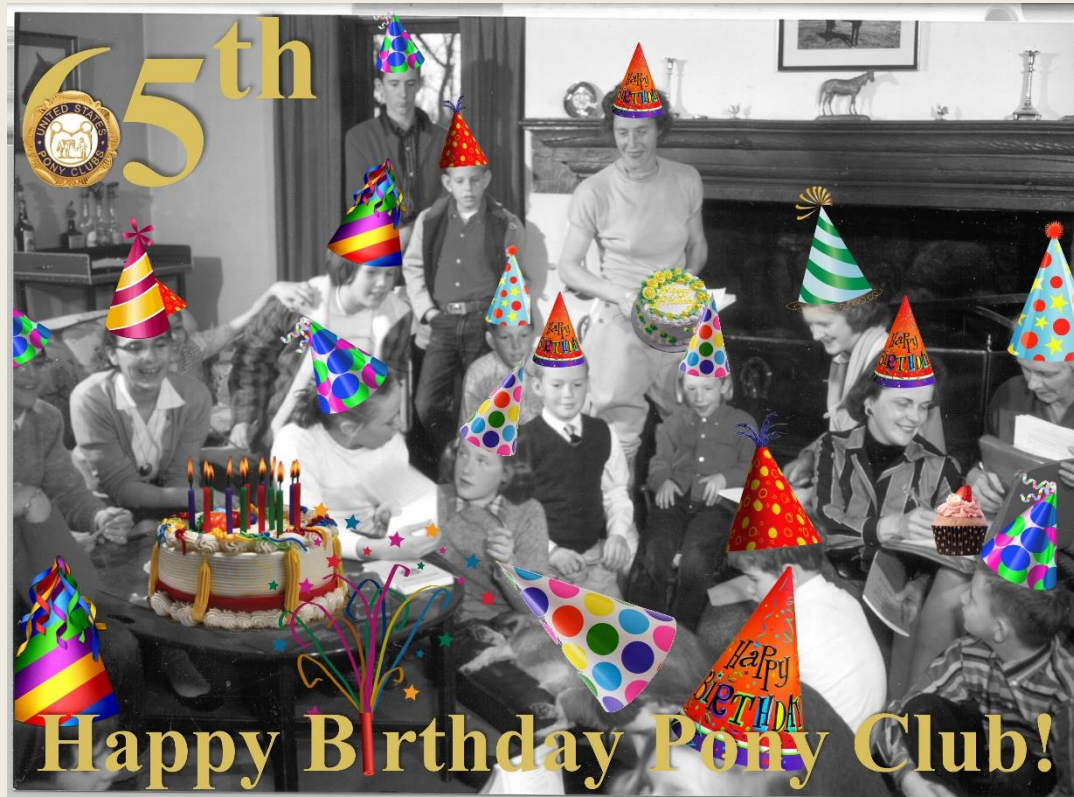
Photo of a 1956 unmounted Pony Club meeting.