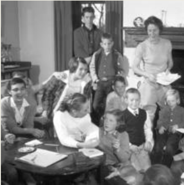
1956 unmounted Pony Club Meeting